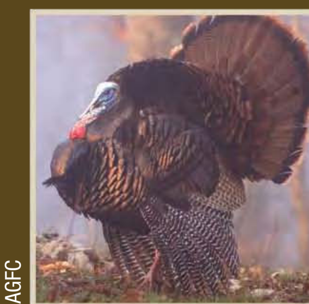
Eastern Wild Turkey

While you're taking the tour, keep an eye out for the following: