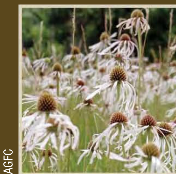
Purple Cone Flower