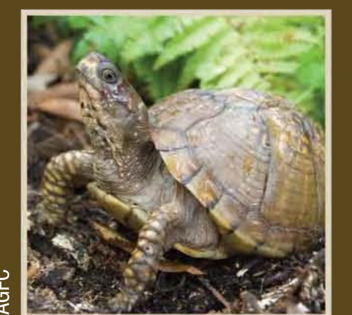
Three-toed Box Turtle